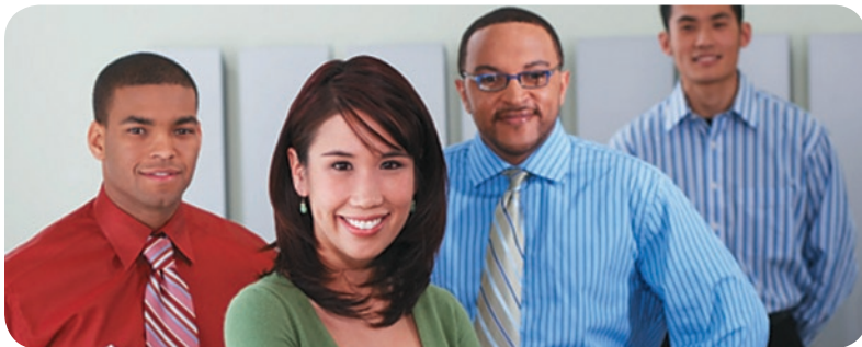
eBay maintains a strong and growing global presence.

Buy items from around the world by expanding your search to display items from non-U.S. sellers. Sell items to buyers around the world simply by expanding your shipping options to “Worldwide.” eBay makes it easy to connect and transact with traders on almost every continent.